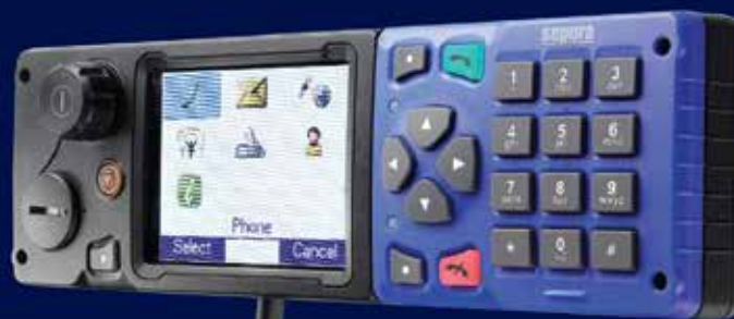
SCC BLUE BEZEL