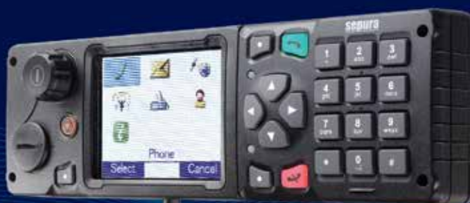
SCC BLACK BEZEL